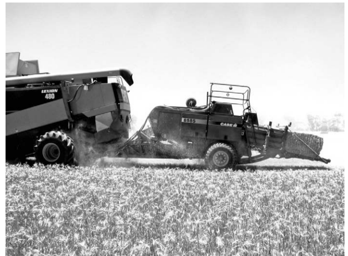
Figure 3. Bale direct system collecting and baling chaff and straw residues during wheat harvest.

the weed seeds present from returning to the cropping field. The large volume of collected chaff is typically dumped in chaff heaps in lines across fields in preparation for subsequent burning to achieve weed seed destruction. Alternatively, chaff material is a valuable livestock feed source and can be grazed in-situ or, in some instances, collected for use in feed-lots. This necessity for post-harvest management of chaff material has limited the Australian adoption of chaff cart collection systems despite their recognized efficacy in the management of major herbicide-resistant weed problems. However, the weed seed targeting efficacy of chaff cart collection systems (Walsh and Powles 2007) maintained the continuing interest in the development of additional HWSC systems.